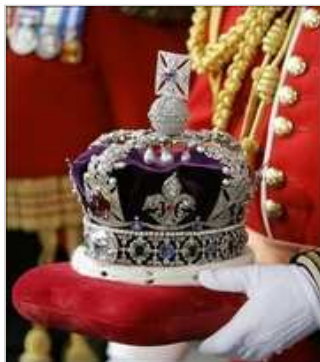
The royal crown is carried out of the House of Lords after the State Opening...